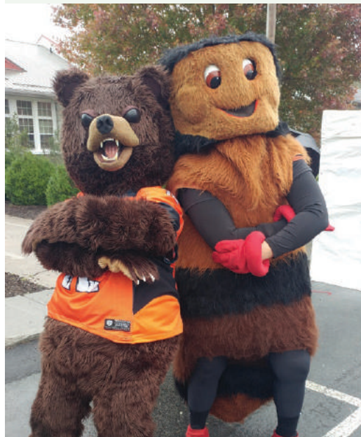
Woolly Worm Festival

In addition to the Woolly Worm Races, the festival features crafts, food vendors, live entertainment, and much more. Tickets are $6 for adults, $4 for children ages 6 to 12, and free for ages 5 and under. www.woollyworm.com